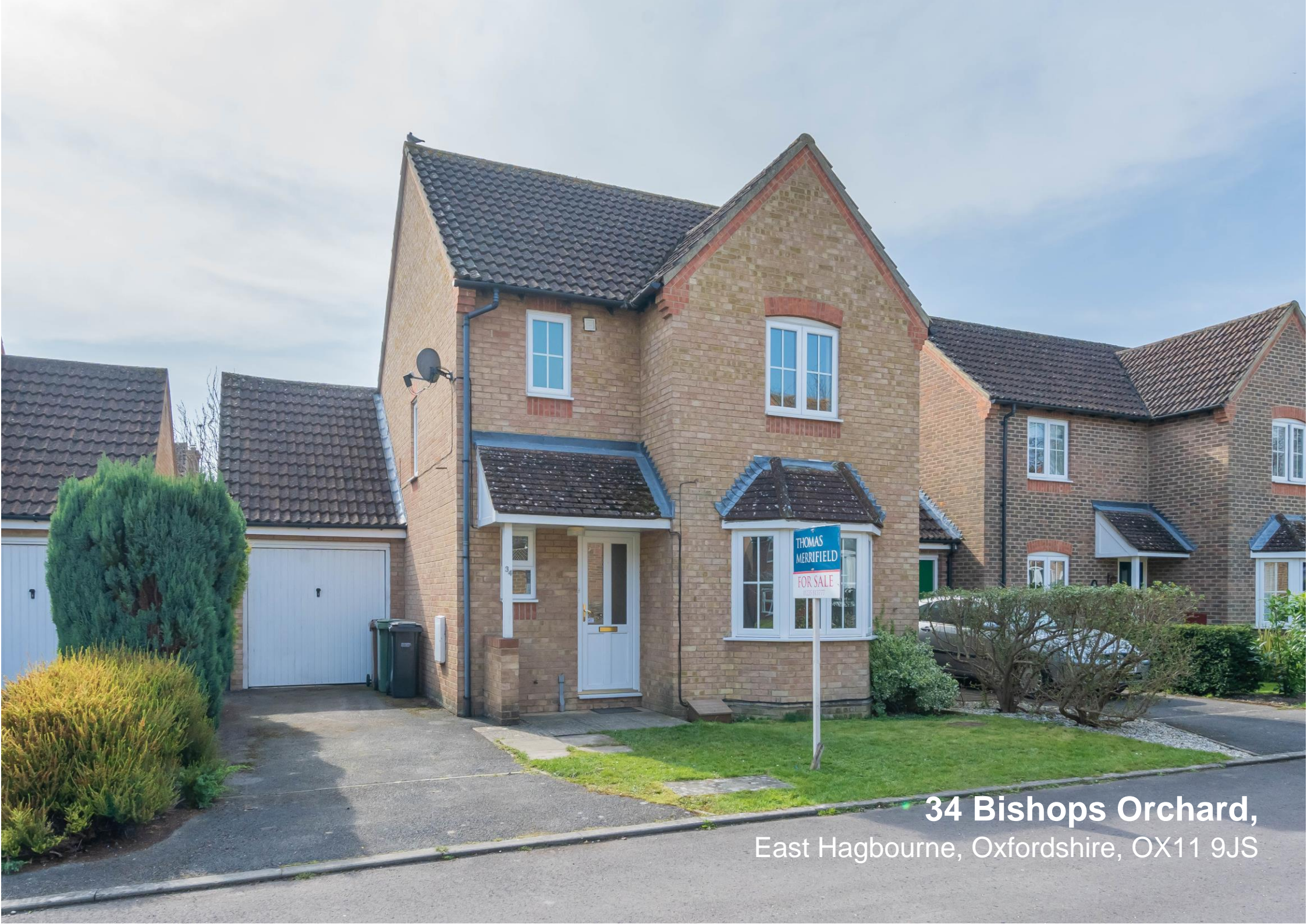
34 Bishops Orchard, East Hagbourne, Oxfordshire, OX11 9JS